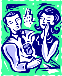
Preparing for married life. How the Church can help.

You have decided to get married in the Catholic Church and we will do everything we can to make your wedding day the most wonderful start to your married life together. We will explain to you everything you need to organise for the service and help you to plan your special day.